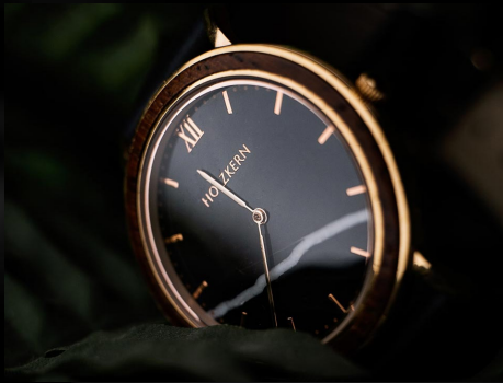
LUXURY BRAND SHOWCASES