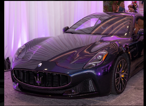
CAR TEST DRIVES