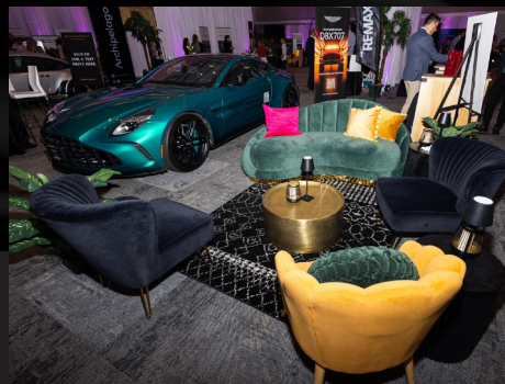
VIP FURNITURE LOUNGES